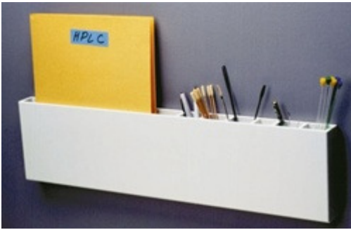
Deluxe holder for tools