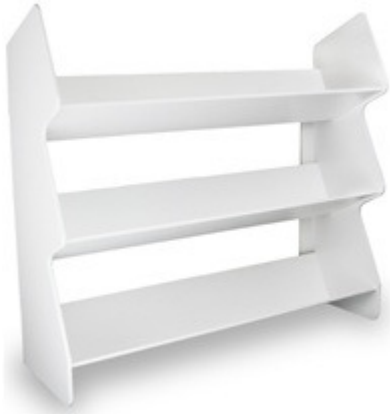
51013 Small Tilted Safety Shelf 12"W x 22"H x 8"D

Series: White PVC Tilted Triple Safety Shelves in 2 Sizes