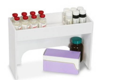
50188 White PVC Step Shelf