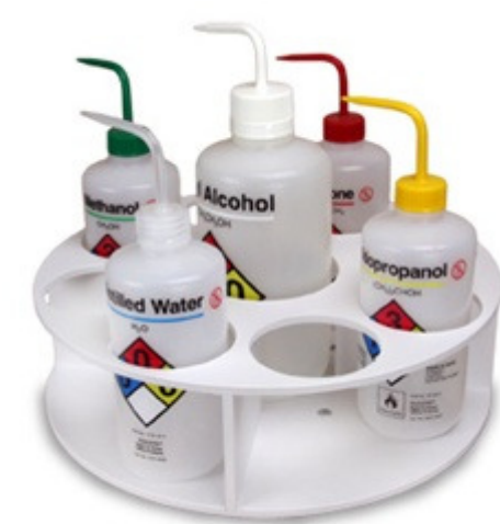
13"W x 4"H x 13"D

Series: 50087 White PVC 9 Position Rotating Bottle Holder in 7 Colors