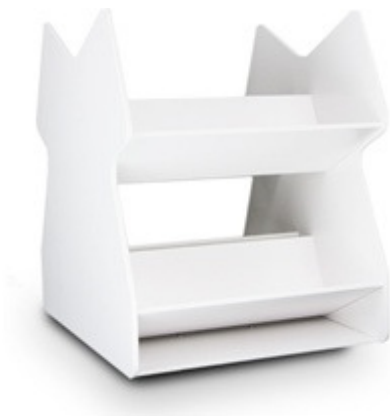
51015 Double Rotating Tilted Safety Shelf

Series: White PVC Rotating Tilted Safety Shelves in 2 Sizes