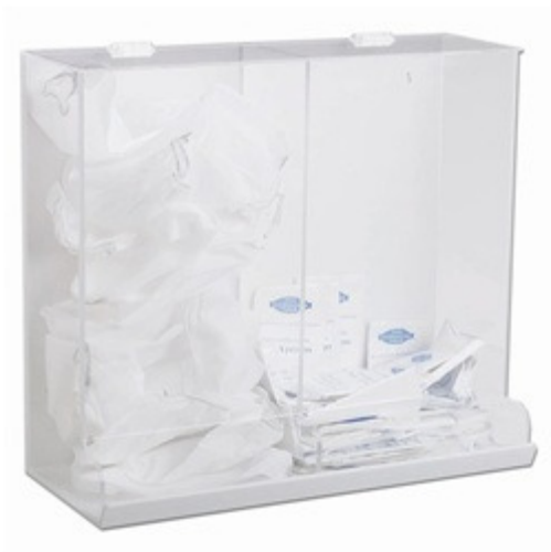
50101 White PVC and Clear Acrylic 2 in 1 Large Apparel Dispensing Bin